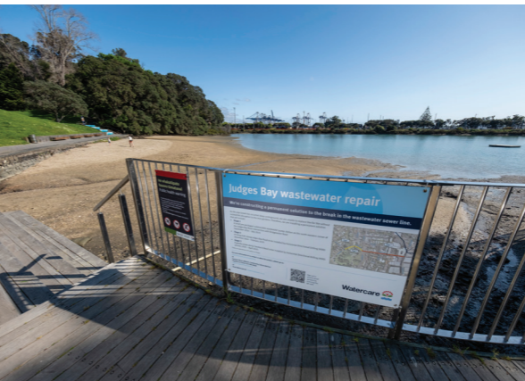
The completed project will greatly reduce wet-weather overflows at Judges Bay.

Once we’ve completed three successful water quality tests at Judges Bay, the long-term black pin - advising against swimming at Judges Bay - will be lifted.