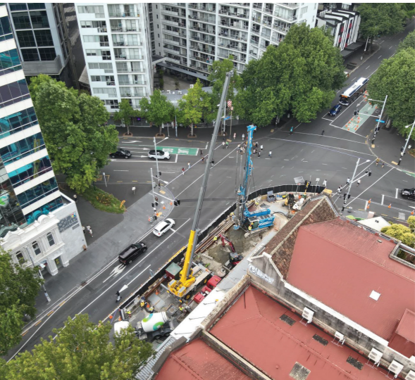
Bird’s-eye view of the construction site on Queen Street.

Work on the Queen Street wastewater diversion is currently underway. Once the three shafts are constructed, a TBM will dig a 600-metre-long tunnel under Queen Street, connecting at each shaft location.