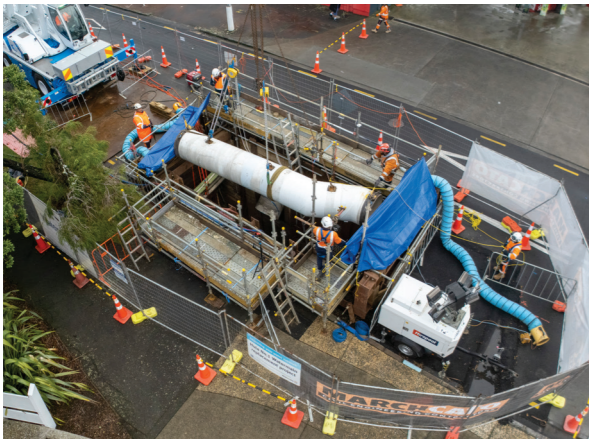
One of the final sections of the Huia 1 replacement pipeline being lowered in on Heaphy Street in Blockhouse Bay in April 2025.

The original watermain was built in the 1940s after World War II. To extend its life we rehabilitated the watermain in the 1980s.