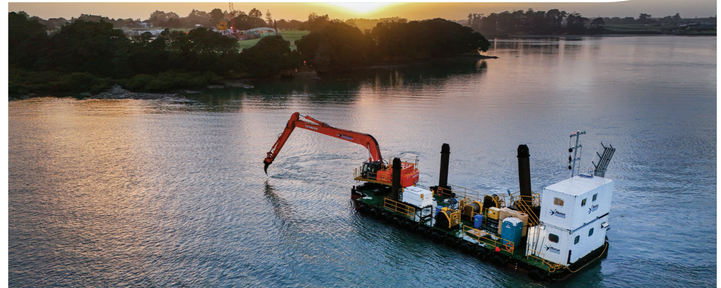
Pictured above: A combi barge – combination of a barge and excavator – is used to construct a tunnel boring machine retrieval pit in the Waiuku channel. This is an essential part of the Clarks Beach outfall pipe project.