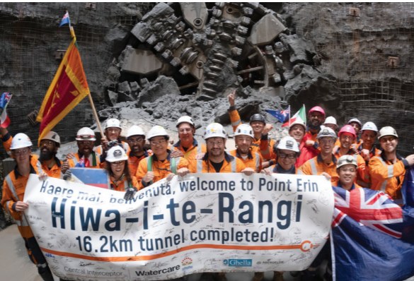
Celebrating Hiwa-i-te-Rangi’s final breakthrough in March 2025.

Within the first four months of the southern section going live, around 93,000 cubic metres of combined wastewater/stormwater were saved from spilling into the environment. That’s the equivalent of 37 Olympic-size swimming pools!