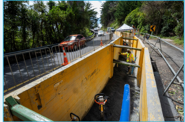
Installation of the water and wastewater pipeline via open trench along the Hibiscus Coast Highway.