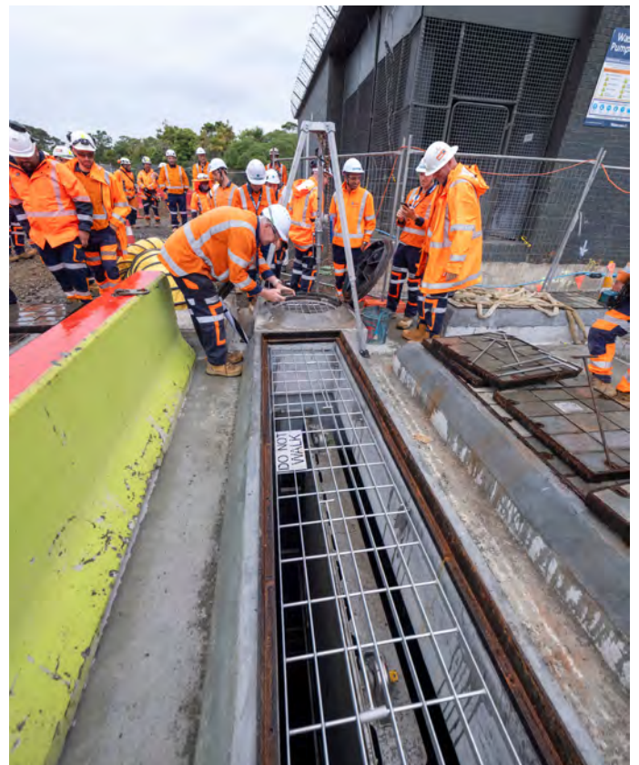
Opening of the gates in January this year

Thank you again for your patience and support throughout this essential infrastructure work for our city.