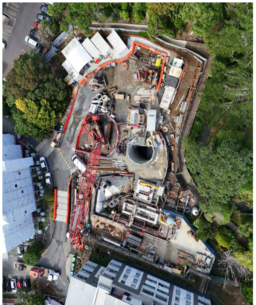
The site from above in April this year

In addition to construction, we've also started an exciting collaboration with Mount Albert Grammar School art students. Together, we're working on a mural that will be installed along the top of the newly built retaining wall. This is an innovative and creative way to reflect the local community's spirit and bring colour to the project area.